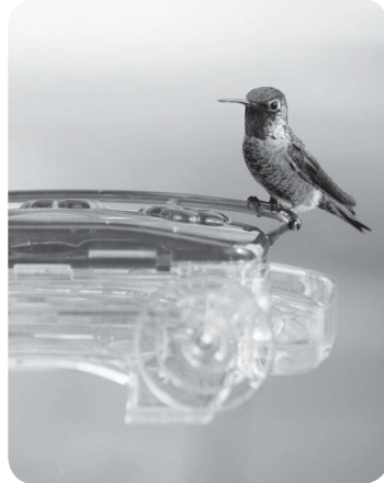
WBU Decorative Window Hummingbird Feeder

While late summer continues to be a wonderful time to feed the birds, unwanted feeder visitors can be troublesome. With the proper feeders, food and accessories, you can enjoy your birds and limit these possible problems.