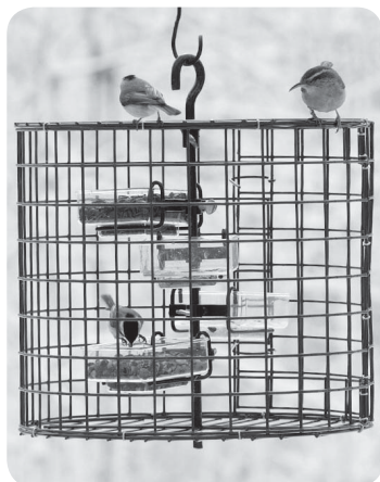
On-Guard™ Cage on SideDish™ Feeder